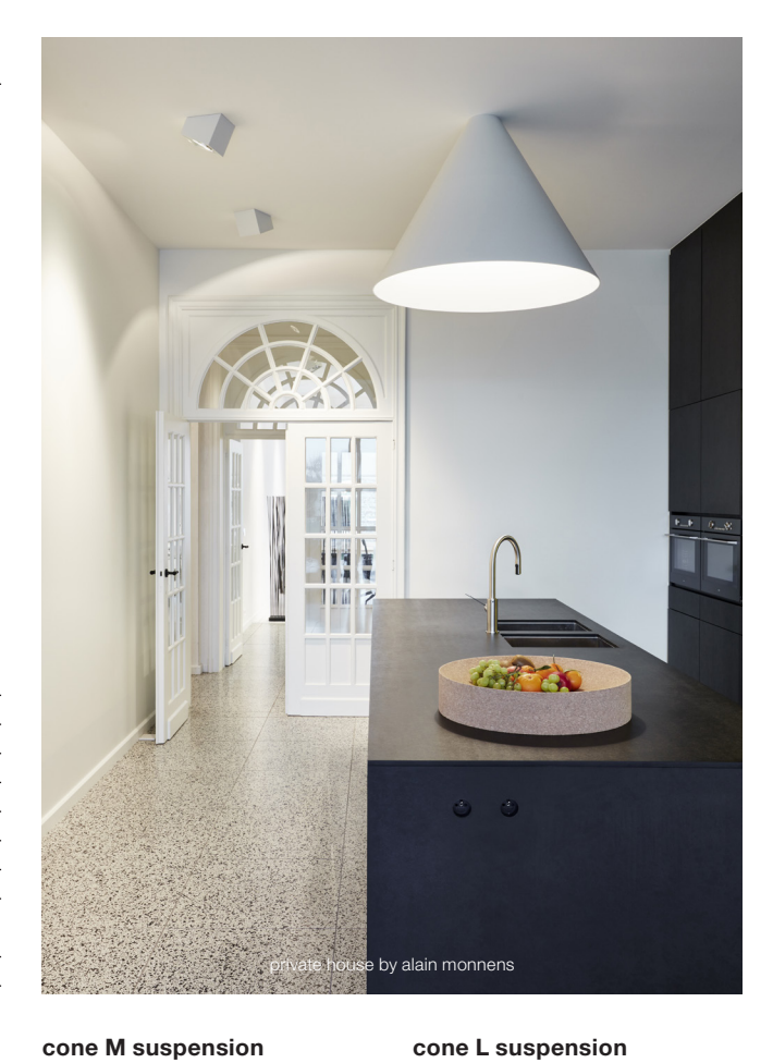
cone L ceiling